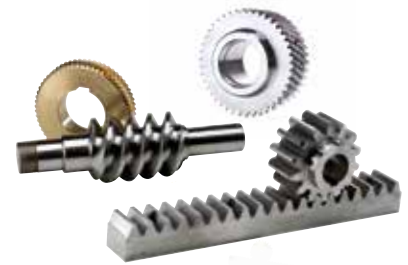
Gear wheels and racks