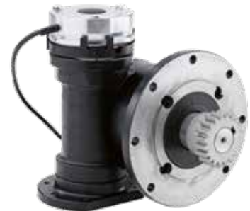
Worm gearbox with special motor flange, output flange and brake