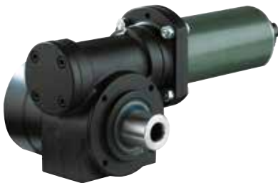
Worm gearbox with special motor flange, output shaft and reduced backlash