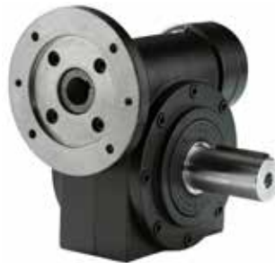
Worm gearbox of cast iron