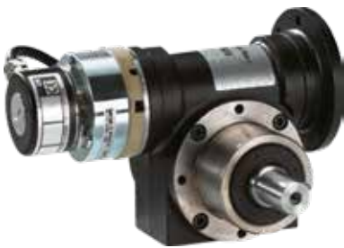
Worm gearbox with special worm shaft for brake and encoder and special output flange