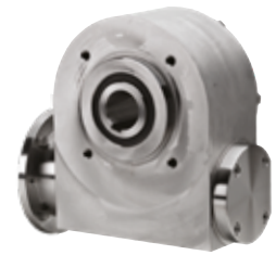
Standard stainless steel worm gearbox