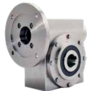
Standard stainless steel worm gearbox