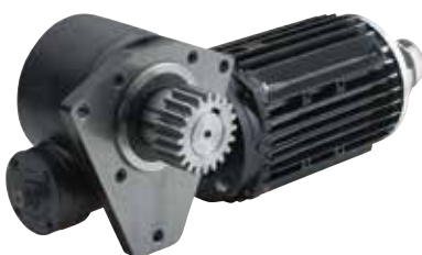
Worm gearbox with special output shaft and flange