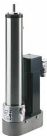
Actuators based on toothed belt drive is in stainless steel and in a hygienic design