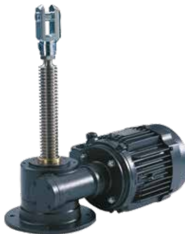
Worm gear screw jack converts a rotary motion into a linear motion with three to four times higher efficiency than other worm gear screw jacks