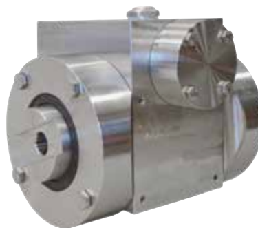
Integrated stainless steel worm gearbox with enhanced bearings and special output shaft