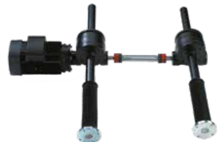
Two worm gear screw jacks assembled for synchronous movement