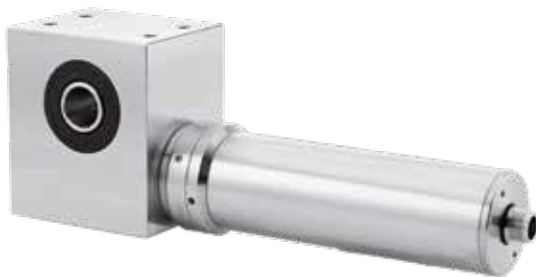
Stainless worm gearbox with a special motor flange for DC motor and a stainless motor shield