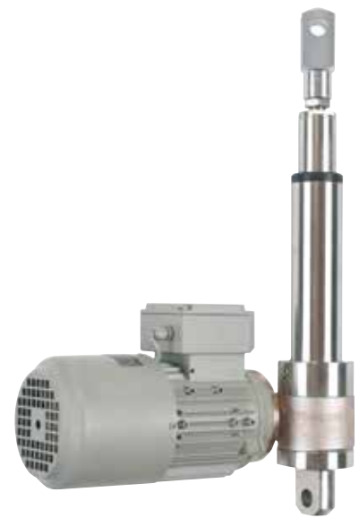
Actuator with inner and outer tubes in stainless steel