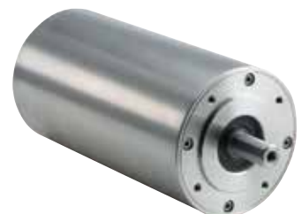
Stainless steel servo motor