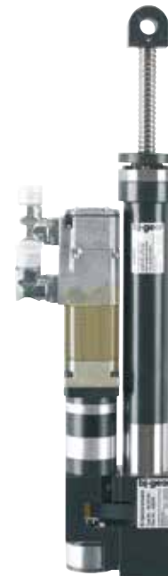
Compact inline actuator with planetary gearbox and servo motor