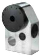
Worm gearbox with double reduction and high safety factors

We ensure a competent delivery from the conception of design and production to delivery of the prototype and subsequently the delivery of the finished product. Our flexible RandD department and our modern production facilities ensure swift production of any special gearbox and actuator at a reasonable price, even in small numbers.