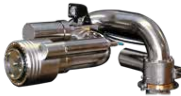
Stainless steel water cannon with 3 special geared motors