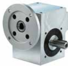
Standard aluminium worm gearbox with output shaft and flange