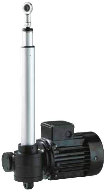
ATEX approved actuator based on a worm gear drive. The actuator is mounted with cylindrical aluminium tubes and an inner threaded spindle