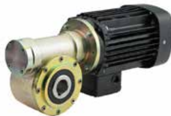
Yellow chromated worm gearbox with motor