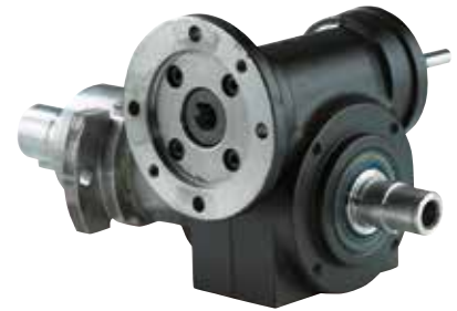
Worm gearbox with special output shaft and flange