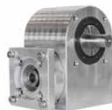
Aluminium worm gearbox with special motor flange and output shaft