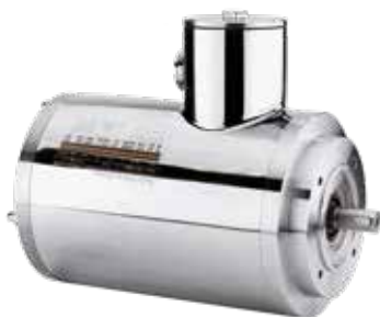
Stainless steel motor