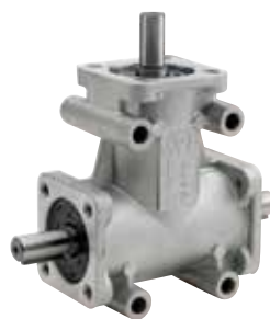
Right angle gearboxes

The planetary gearboxes are typically applied for servo solutions and positioning tasks and are available as straight or angle planetary gearboxes.