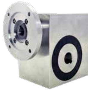
Premium stainless steel worm gearbox