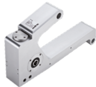
Special gearbox solution integrated in a lever arm