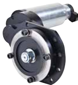
2-step helical gearbox with DC motor, brake and encoder